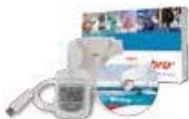
EBI 20-T1-Set Temperature logger set (temperature logger, evaluation software, interface)