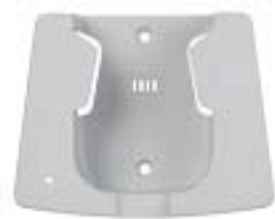
EBI 20-WM-1 truck wall bracket