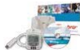
EBI 20-TH1-Set Temperature Humidity Logger Set (Logger, Evaluation software, Interface)