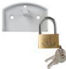
EBI 20-WM wall bracket