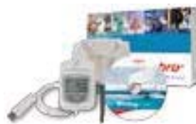
EBI 20-TF-Set Temperature logger set (logger with external probe up to +100 °C (+212 °F), evaluation software, interface)