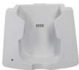
EBI 20-IF Interface