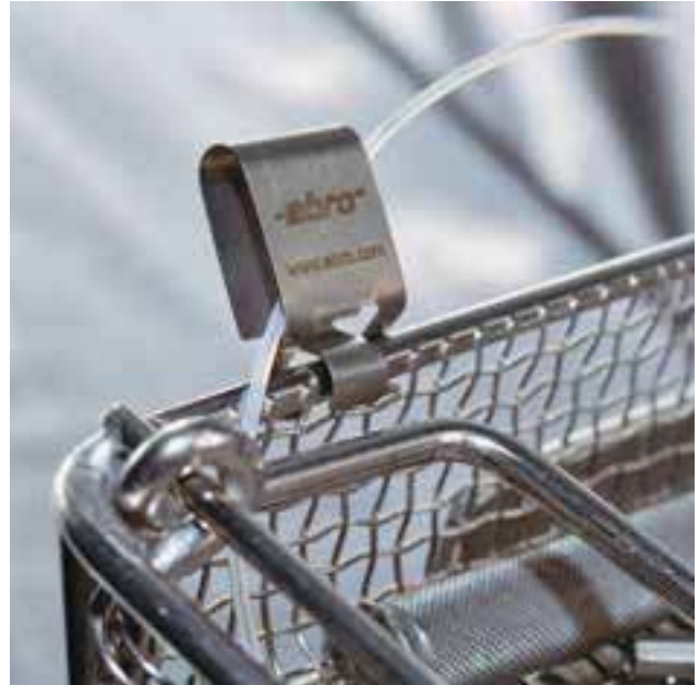
Temperature inside the data logger