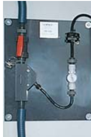
PF 105 sample bypass